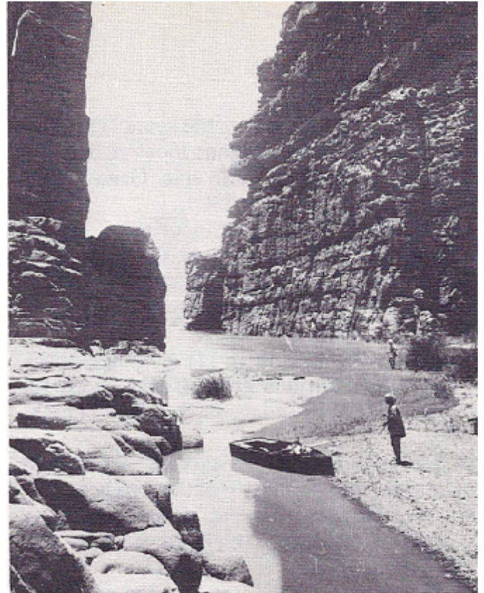
Arnon River. Sometimes described as the "brook" Arnon, the mighty Arnon River carves a deep gorge that bisects the highlands east of the Dead Sea. For this reason, the Arnon is nearly always mentioned in the Bible as a frontier—first as the southern frontier of the Amorites, and later as a border of Reuben (Num. 21:13).

Ashdod [Azotus] ("stronghold"), one of the five chief Canaanite cities; the seat of the worship of the fish