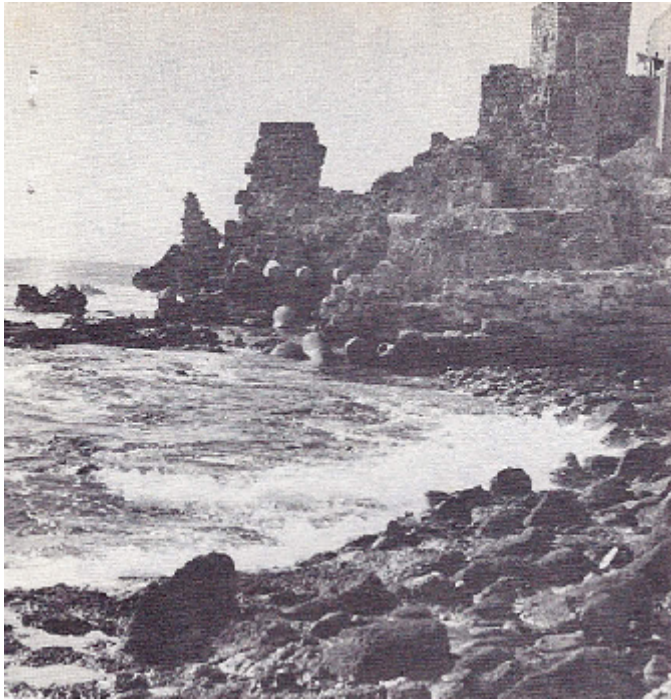
Ruins of Caesarea . Built by Herod the Great, this magnificent city stood on the Mediterranean shore of Palestine. Named in honor of Augustus Caesar, it was a celebrated trading center and seaport . Paul departed from Caesarea on his way to Tarsus, having escaped his Jewish enemies in Damascus (Acts 9:30).

Chesalon ("hopes"), a town on Mount Jearim of Judah, about 16 km. (10 mi.) west of Jerusalem (Josh. 15: 10).