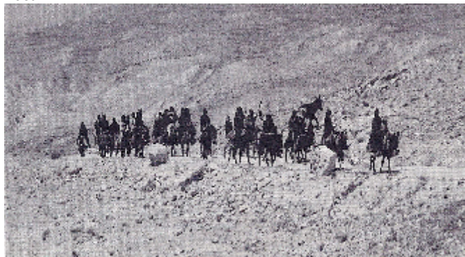
Caravan of Dedanites. These Arabs are descendants of Dedan, the grandson of Abraham mentioned in Genesis 25:3. The Dedanites figured prominently in the trade and commerce of the Ancient Near East.

One might well call ancient Corinth a "sin city." While rather low moral values were held by the general Roman public, Corinth had a reputation for embracing the lowest of the low. Even prior to the time of the apostle Paul, "to live like a Corinthian" was a slang phrase denoting loose, immoral conduct.