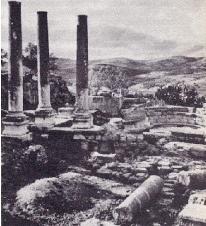
Ruins of Samaria. A city with a long history, Samaria was capital of the northern kingdom of Israel from the reign of Omri in the ninth century B.C. This basilica near the forum at Samaria was built by Herod the Great, who named the town Sebaste in honor of his Roman patron, Augustus ( Sebaste is the Greek equivalent of the Latin Augustus ). The evangelist Philip preached here, as did Peter and John (Acts 8:5-25).

Seneh ("enemy"), the more southerly of two rocks in the passage between Michmash and Geba (1 Sam. 14:4-5). It is 10.5 km. (6.5 mi.) northeast of Jerusalem.