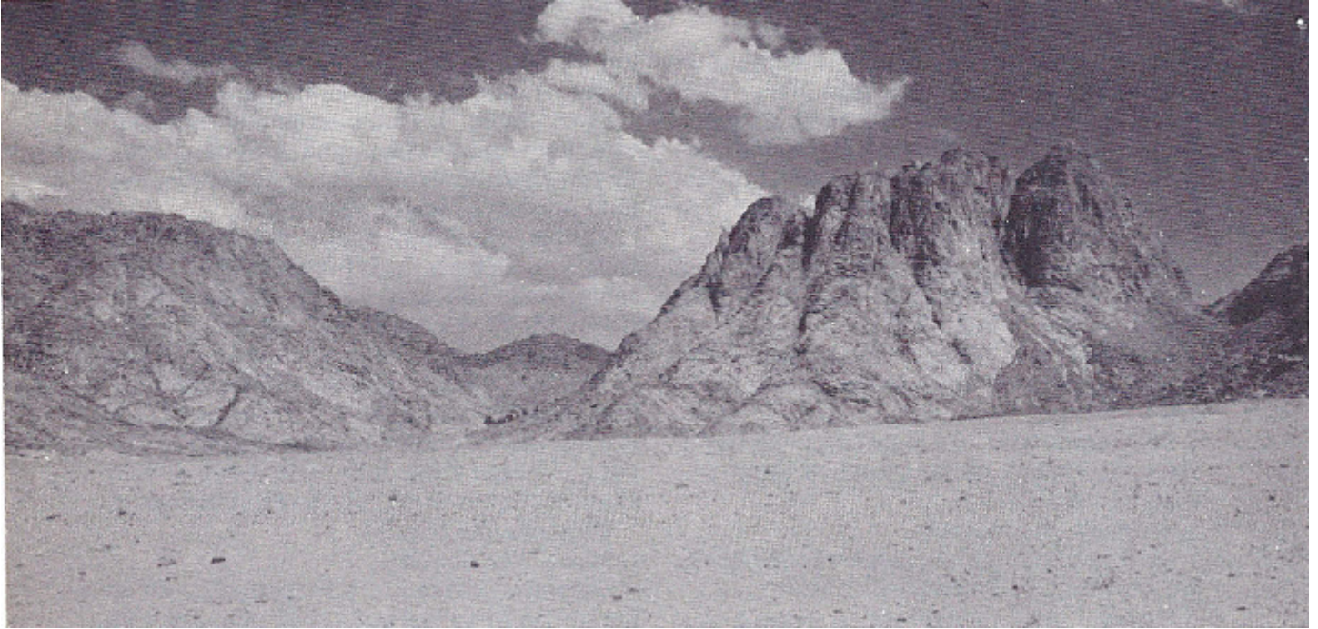
Mount Sinai. Viewed from a trail leading to its summit, Jebel Musa (right) is traditionally considered to be the biblical Mount Horeb, or Sinai. The Lord revealed himself to Moses on this mountain, giving him the Ten Commandments and other laws (Exod. 20:1-17). Jebel Musa is located on the southern portion of the Sinai Peninsula between the Red Sea and the Gulf of Aqaba.

Mediterranean and was bounded by the Taurus Mountains to the north.